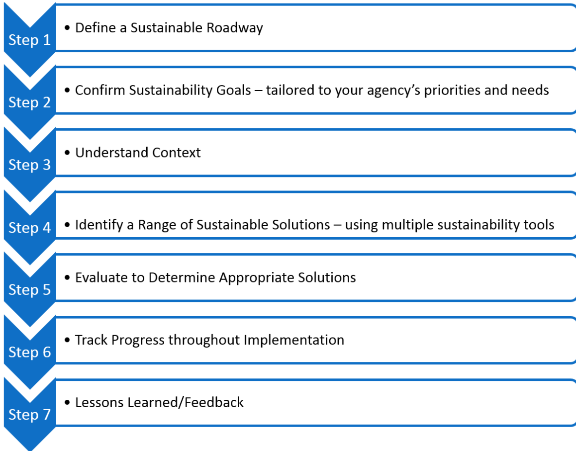
Figure: Seven Step Approach to Using Multiple Sustainability Tools Together

“The use of one or more evaluation tools will likely provide a greater selection of applicable sustainable solutions. This is advantageous as it can maximize the number of solutions that best fit the context and phase of the project. In addition, focusing on only one evaluation tool can skew the project team to prioritize high point value solutions to achieve credit for actions that may not be sustainable. Using multiple evaluation tools and evaluating their solutions against the goals of an agency or project provides the project team an opportunity to focus on key sustainability goals and accomplish them without losing focus by trying to score highly within any particular tool.”